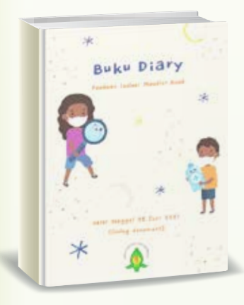
▲ IPS Guideline for quarantine and isolation of children infected with COVID-19

IPS has also published COVID-19 Guidance for Safe School in August 2021 when schools reopened in Indonesia. Below are some of the published Guidance for schools: