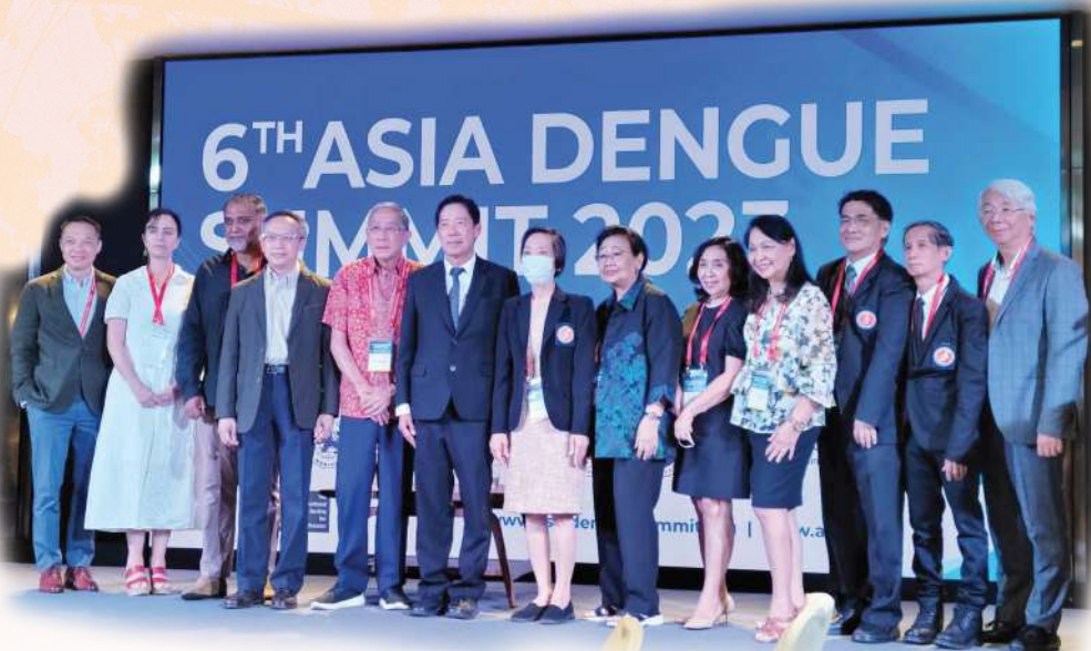
Group photo of the Committee