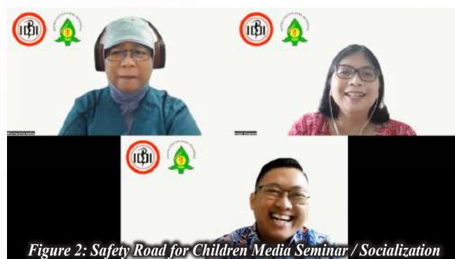
Figure 2: Safety Road for Children Media Seminar / Socialization