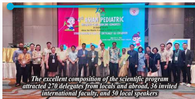
The excellent composition of the scientific program attracted 270 delegates from locals and abroad, 36 invited international faculty, and 50 local speakers