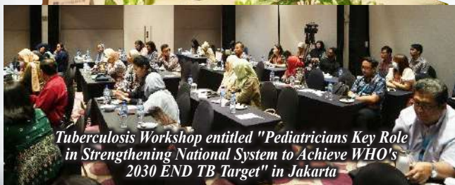
Tuberculosis Workshop entitled "Pediatricians Key Role in Strengthening National System to Achieve WHO's 2030 END TB Target" in Jakarta