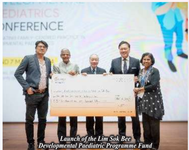
Launch of the Lim Sok Bee Developmental Paediatric Programme Fund