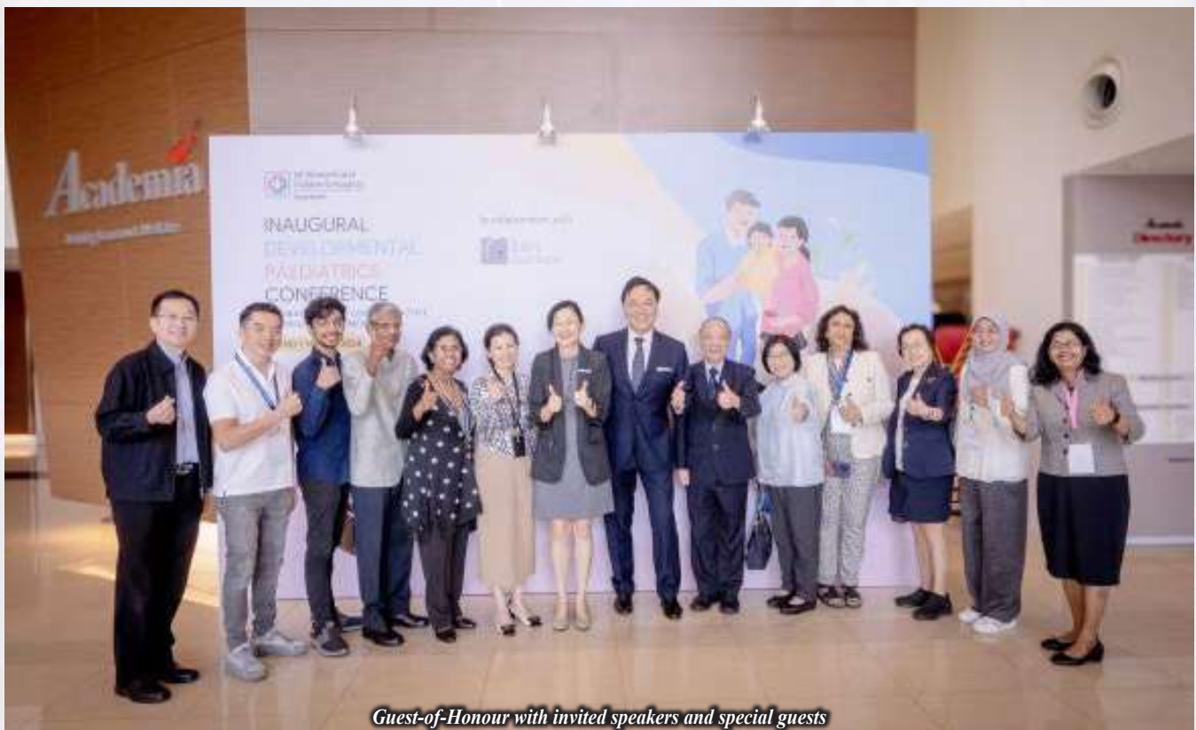
Guest-of-Honour with invited speakers and special guests