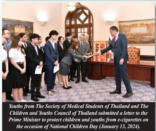
Youths from The Society of Medical Students of Thailand and The Children and Youths Council of Thailand submitted a letter to the Prime Minister to protect children and youths from e-cigarettes on the occasion of National Children Day (January 13, 2024).