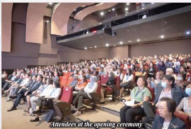
Attendees at the opening ceremony