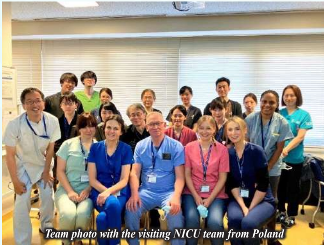
Team photo with the visiting NICU team from Poland

I am grateful for the opportunity offered by the Japan Pediatric Society (JPS) and the Asia Pacific Pediatric Association (APPA) to help Pediatricians from countries in the Asia Pacific to experience and learn from world renowned hospitals in Japan.