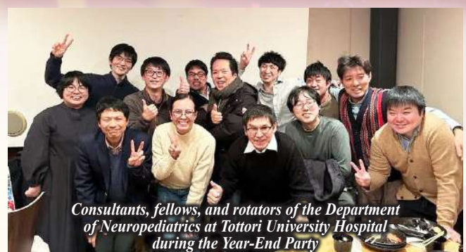
Consultants, fellows, and rotators of the Department of Neuropediatrics at Tottori University Hospital during the Year-End Party