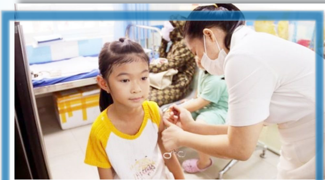
A child gets vaccinated against measles at the Centre for Disease Control in Ninh Thuan Province.

In 2024, the country reported 45,554 suspected measles cases, including 7,583 confirmed infections and 16 deaths linked to the disease.