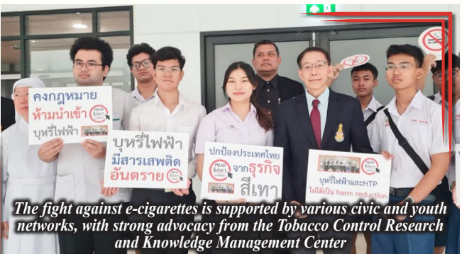
The fight against e-cigarettes is supported by various civic and youth networks, with strong advocacy from the Tobacco Control Research and Knowledge Management Center

cause severe lung injury. They are not a "harm-reduction" measure, contrary to some claims.