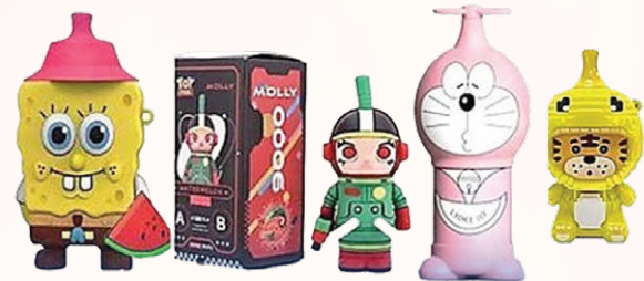
E-cigarettes designed and marketed to resemble children's toys

As the use of e-cigarettes among children and youth continues to rise at an alarming rate, certain politicians are advocating for the legalization of e-cigarettes, which would make them more accessible and likely result in greater harm to children and youth.