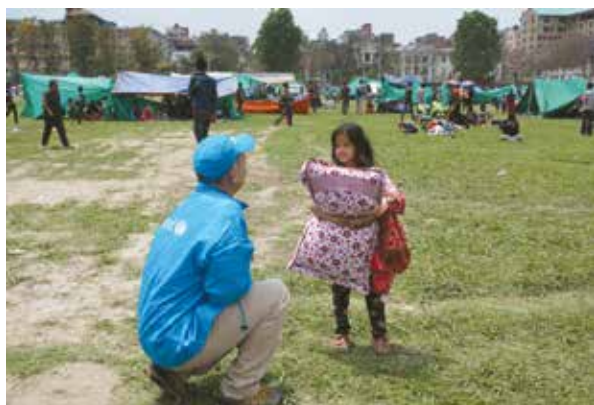
A UNICEF worker speaks to a child seeking temporary shelter in Kathmandu following Nepal's massive earthquake.

particularly vulnerable - limited access to safe water and sanitation will put children at great risk from waterborne diseases, while some children may have become separated from their families.