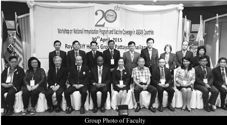
Group Photo of Faculty

The Pediatric Infectious Disease Society of Thailand (PIDST) was formed on 24 January 1995. This year it celebrates 20 years of influential existence by having an annual congress with the involvement of ASEAN Paediatric leaders in vaccine advocacy and research. A workshop on National Immunisation Program and Vaccine Coverage in ASEAN countries was organised on 30 th April 2015 before the start of the 19 th Annual Meeting of PIDST. The venue was the prestigious Royal Cliff Hotels in Pattaya.