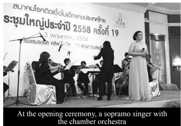
At the opening ceremony, a soprano singer with the chamber orchestra